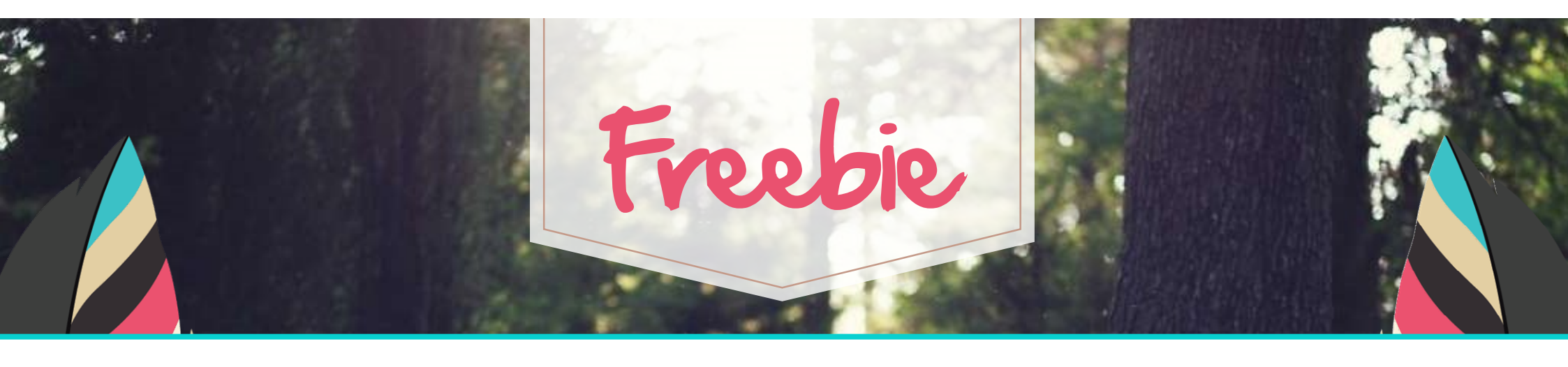
Queen Of Her Team Loyalty Planner: Refer to included video that guides you on what to use in your funnel. I encourage you to add your own flavour!

Admit it, some of the time you forget to keep your team in the loop of your brainy ideas. You can't help it! You're a big picture kind of person who has huge dreams – and you're grateful for the team that help you get there. So lets map out a plan to ensure their loyalty and continual support. They deserve it <3